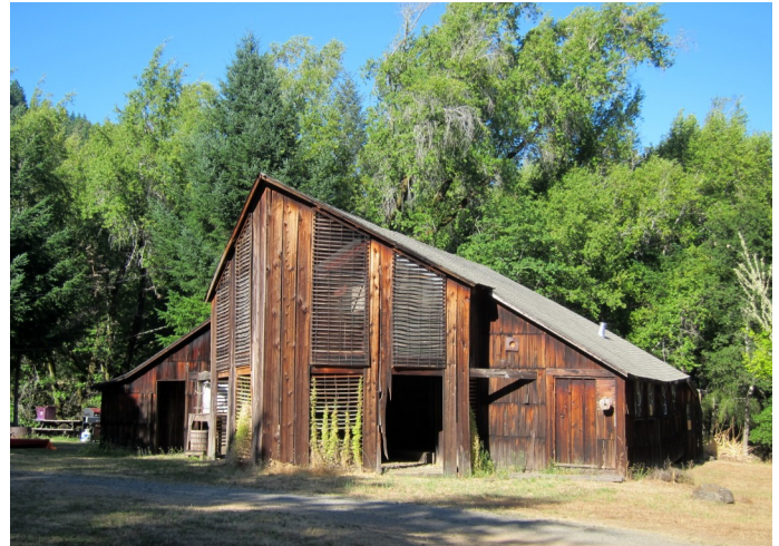
Pond Farm is in Austin Creek State Recreation Area

Pond Farm includes two small residences and a historic barn repurposed as a pottery studio in the Austin Creek State Recreation Area in Sonoma County’s Russian River Valley. The property’s modest scale and design belie its historical importance as the home and studio of an internationally-prominent ceramicist, Marguerite Wildenhain. Since Marguerite’s death in 1985, her home and the barn have been unoccupied and the elements and the lack of routine maintenance have taken their toll.